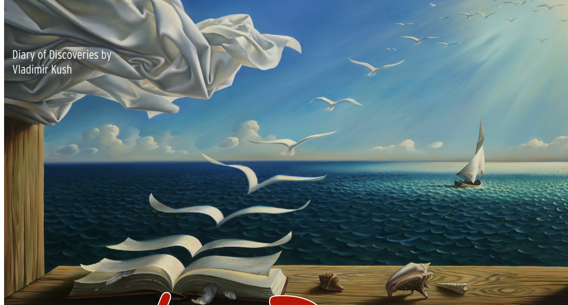
Diary of Discoveries by Vladimir Kush